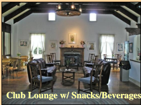
Club Lounge w/ Snacks/Beverages