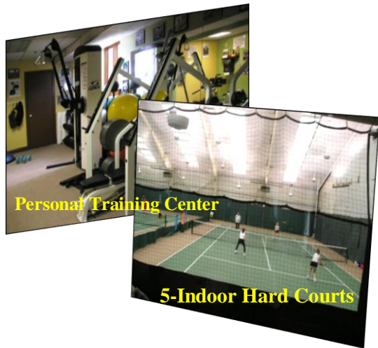
Personal Training Center